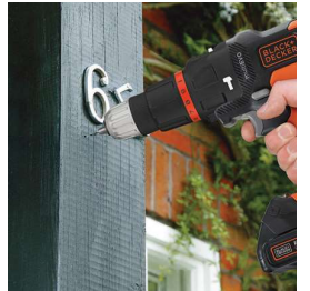
All screwdriving applications Drill holes in wood, metal and plastic